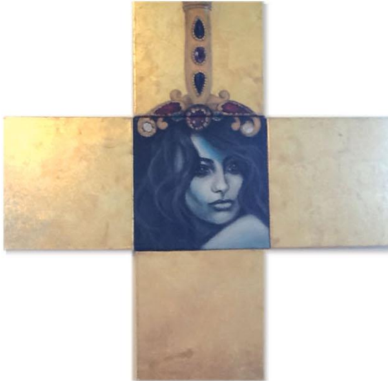
Their Eyes On Her Flash (vinyl based paint), W 36" H36", 2014