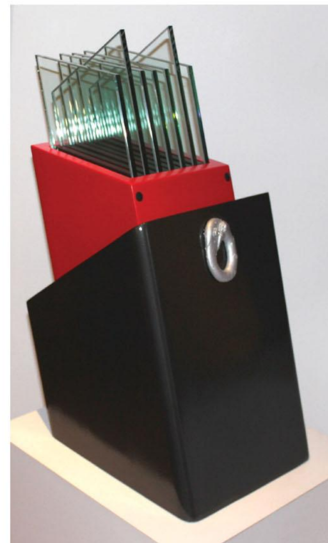
Merciful Angel Mixed media, W 17" H24" D12", 2004