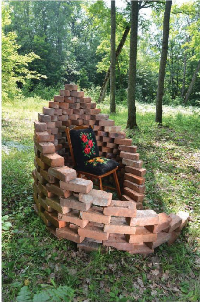
Where I Begin...