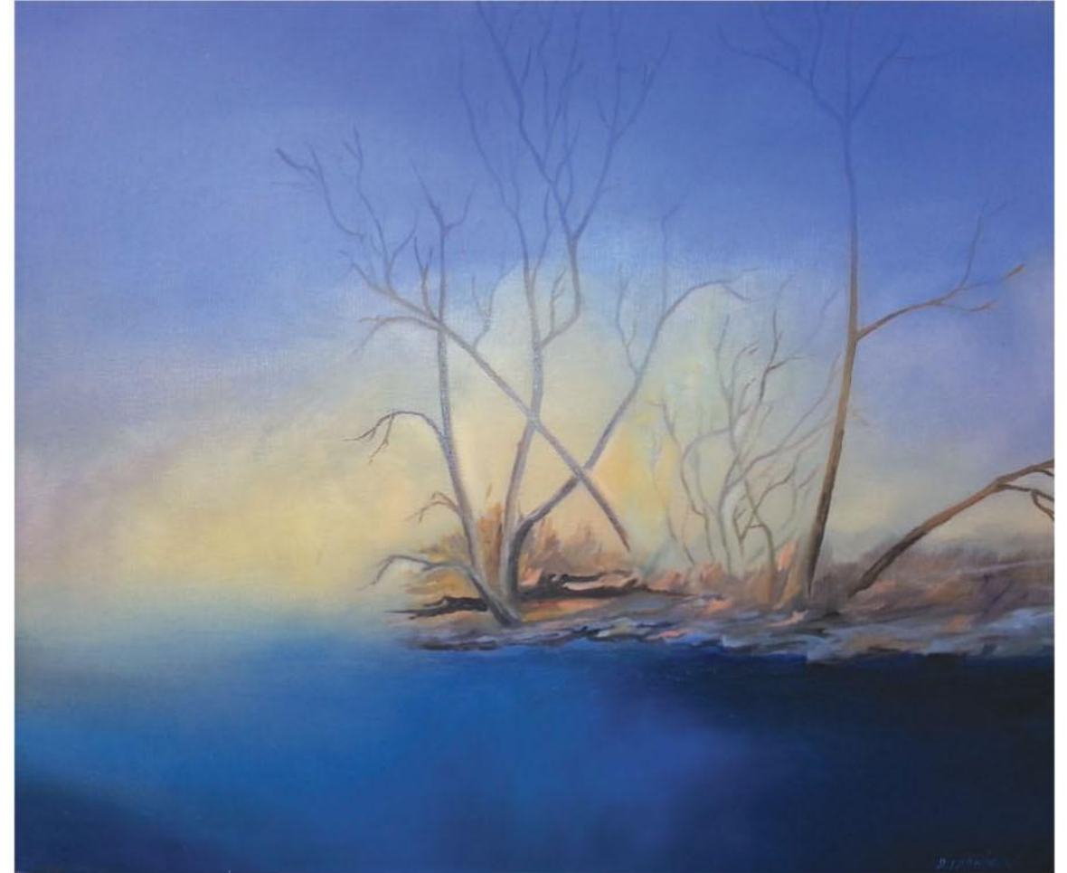
Theme from Montenegro Oil on canvas, W 20" H16", 2012