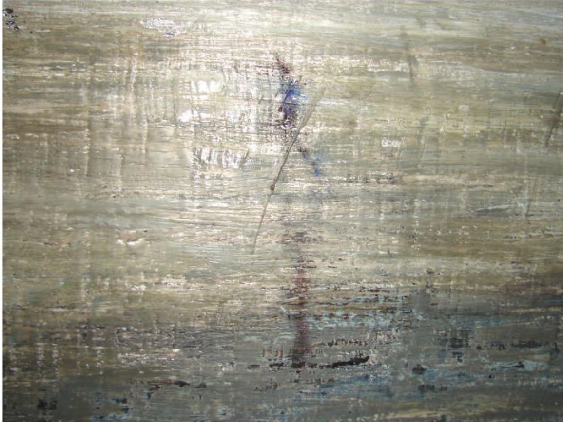
Fast Runner Mixed media (wax, oil paint and pigment), W 48" H48", 2011