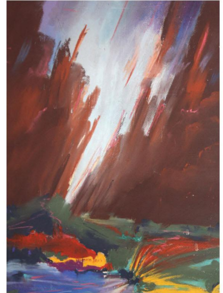
Sky Symphony 3 Soft pastel, W12" H16", 2014